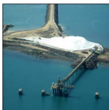
Dampier, Salt Partners