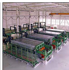
Asahi Glass B1, Krebs Swiss