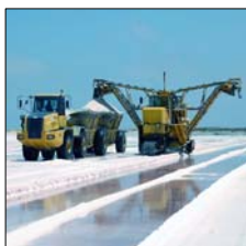
ROV Durrant, Salt Partners