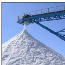
Renoeste, Salt Partners