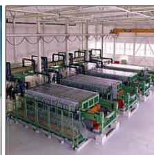
Asahi Glass B1, Krebs Swiss