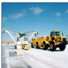
SH 1000, Durrant