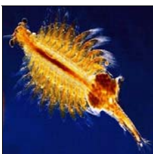
Artemia Salina