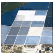
Dampier Salt