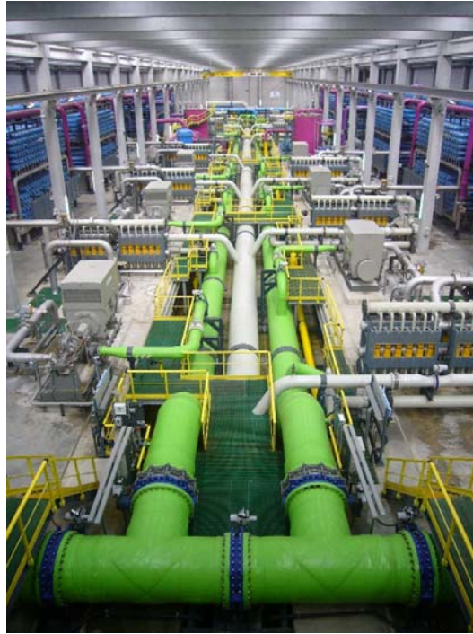
Seawater reverse osmosis desalination plant GRELLIER

on Wednesday, 15th November 2017 at 09.10 at the Salt 2017 Middle East International Conference for the Salt Industry, organised by Roskill at the Marriott Hotel Al Jaddaf in Dubai.