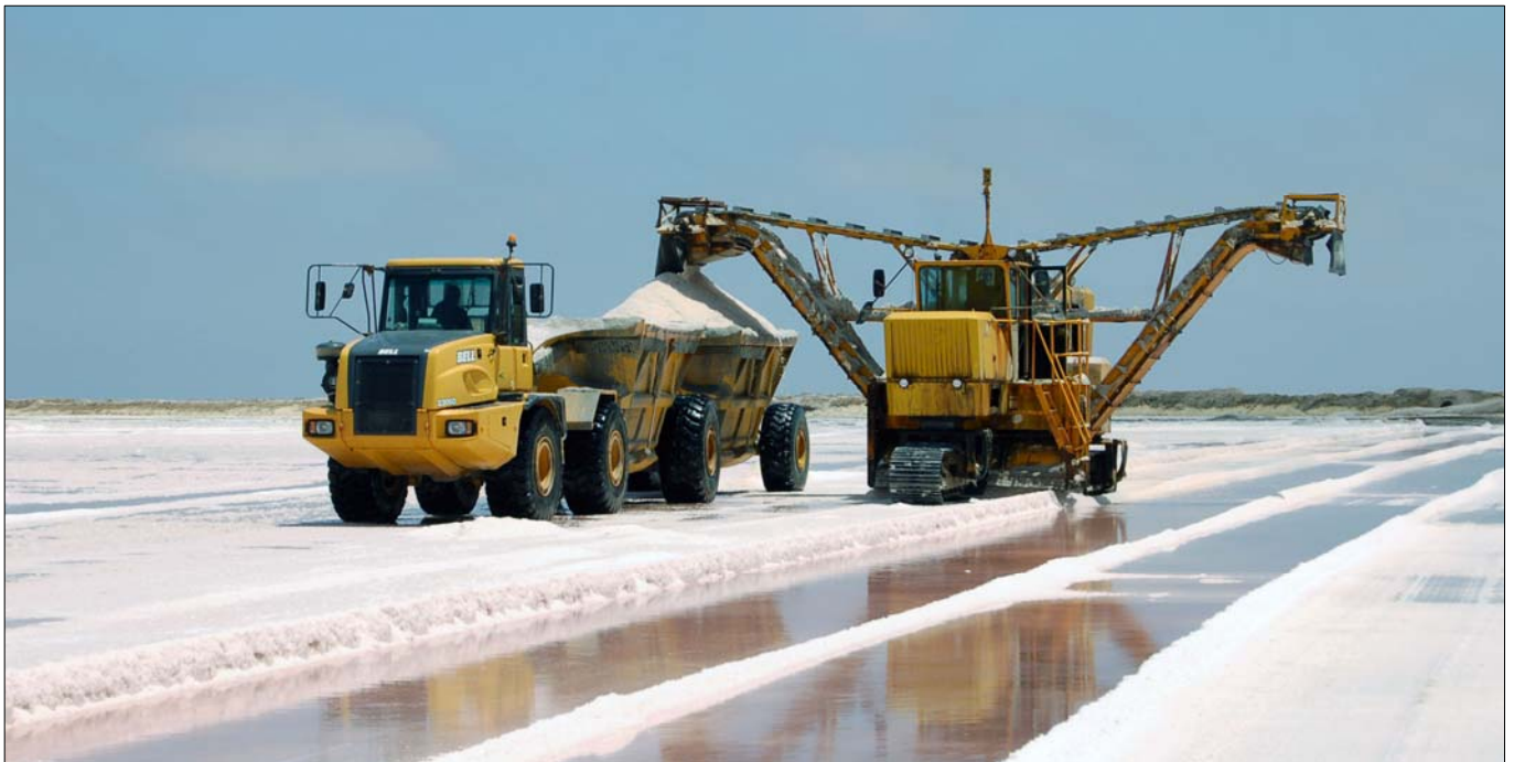
ROV Durrant / Walvis Bay / Namibia

at the 2010 India International Salt Summit organised by The Indian Salt Manufacturers Association at Nirma University Auditorium, SG Highway, Ahmedabad, Gujarat, India.